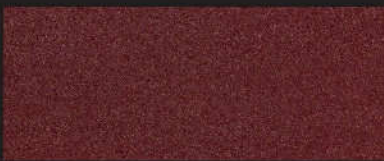
2109 Anilin H weinrot