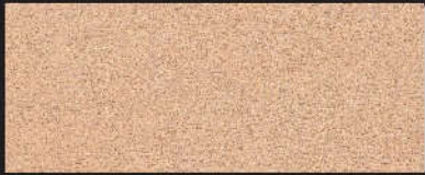
2121 Anilin naturell vegetabil*