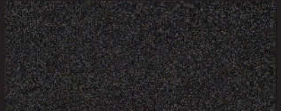
2101 Anilin H schwarz