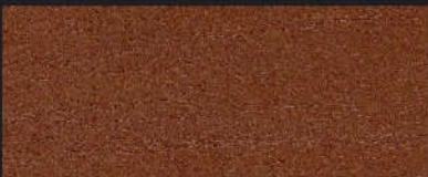
2116 Anilin H mahagoni