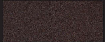
2118 Anilin H brasil