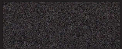
2111 Anilin H dunkelbraun